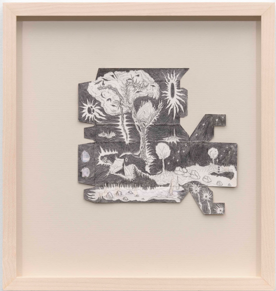
Extra slim, about 400 million yrs. ago, 24.5 x 26cm, Graphite on found unfolded cardboard