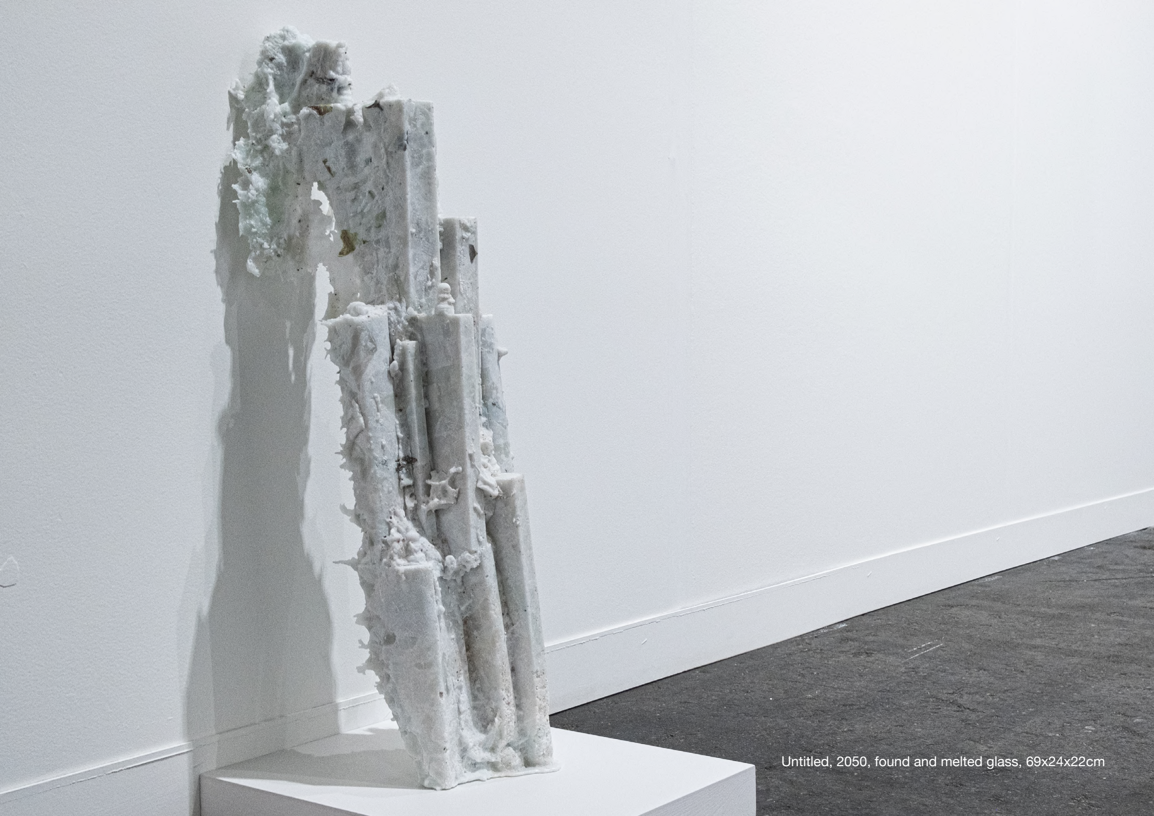
Untitled, 2050, found and melted glass, 69x24x22cm