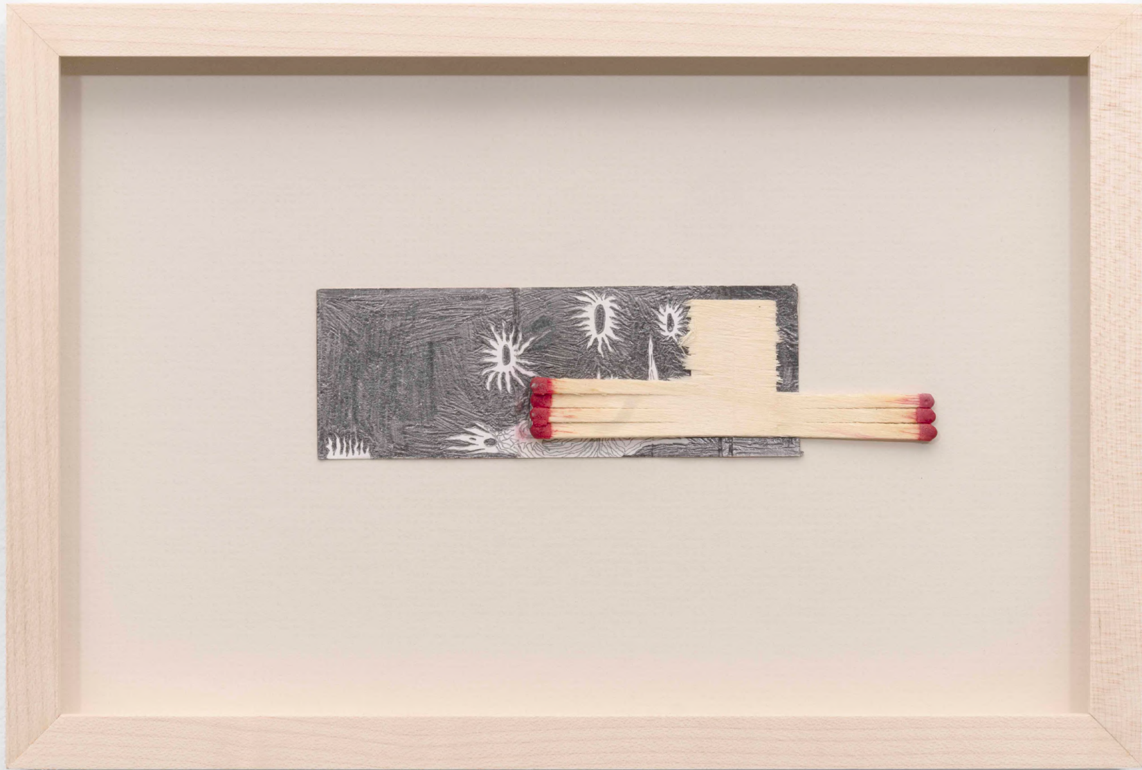
Feudo, about 400 million yrs. ago, 17.5x26cm, Graphite on found unfolded cardboard