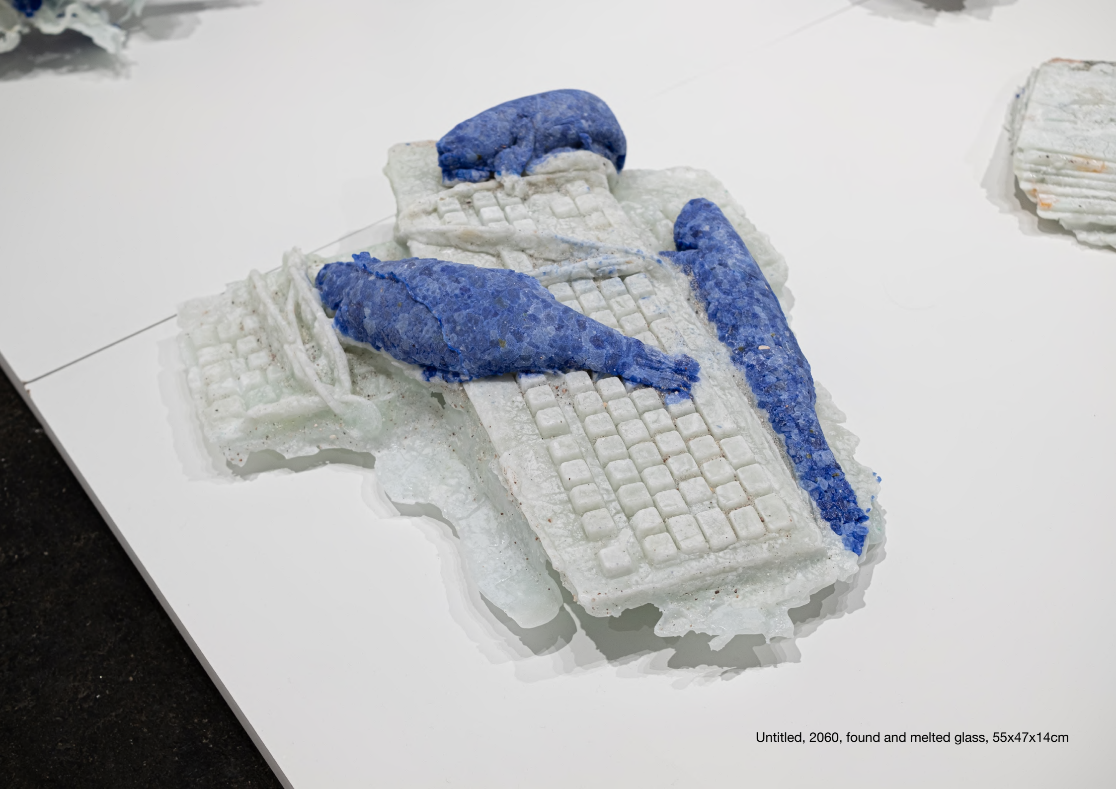
Untitled, 2060, found and melted glass, 55x47x14cm