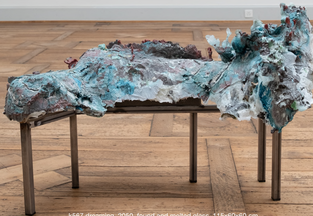
k567 dreaming, 2050, found and melted glass, 115x60x60 cm