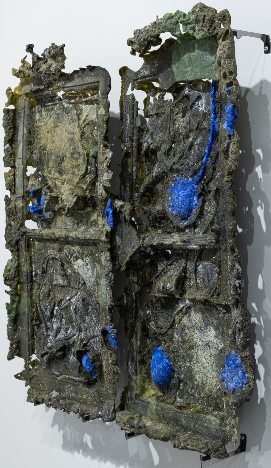
Close landscape, 2050, found and melted glass, 103x106x30cm