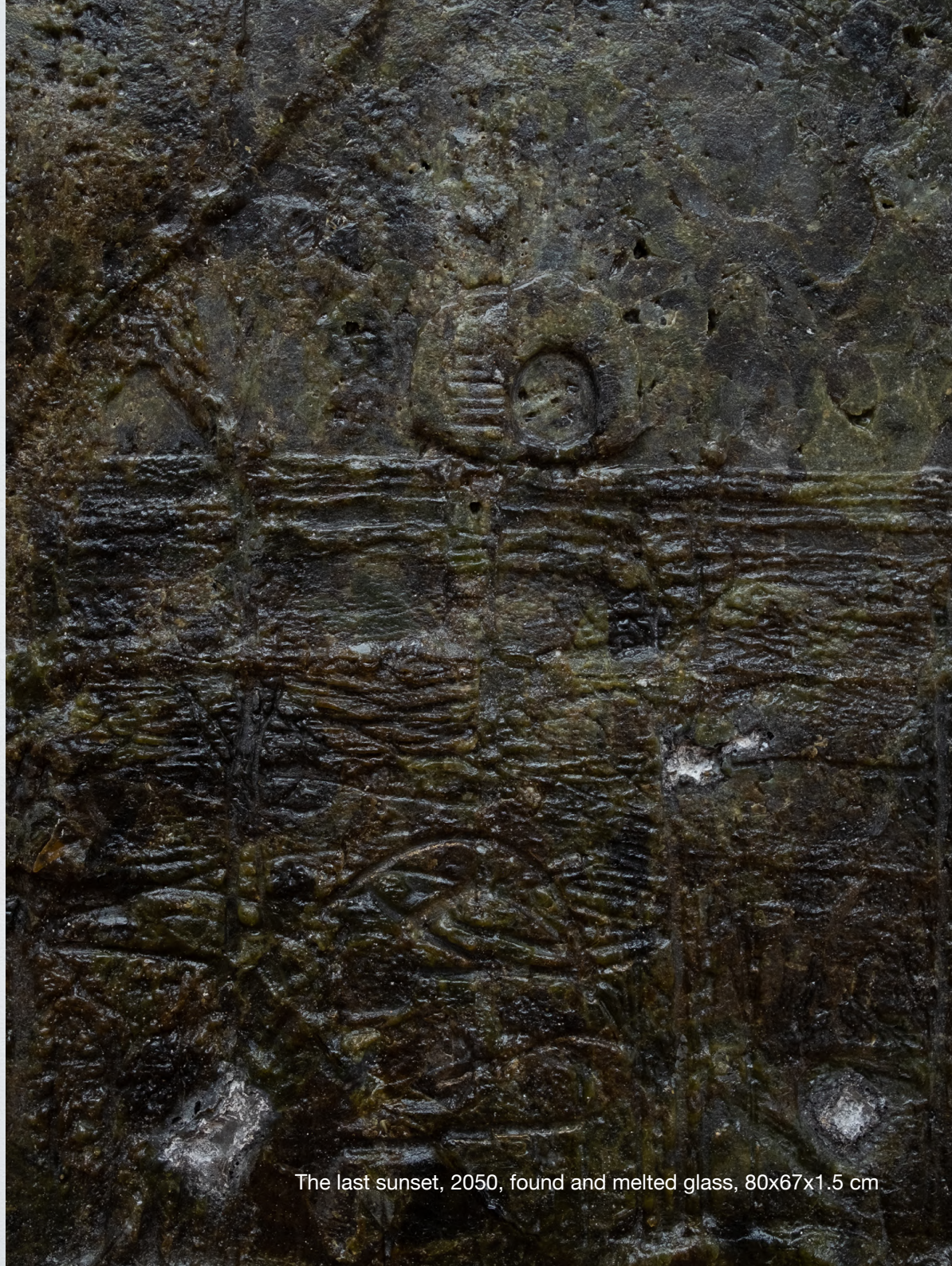
The last sunset, 2050, found and melted glass, 80x67x1.5 cm