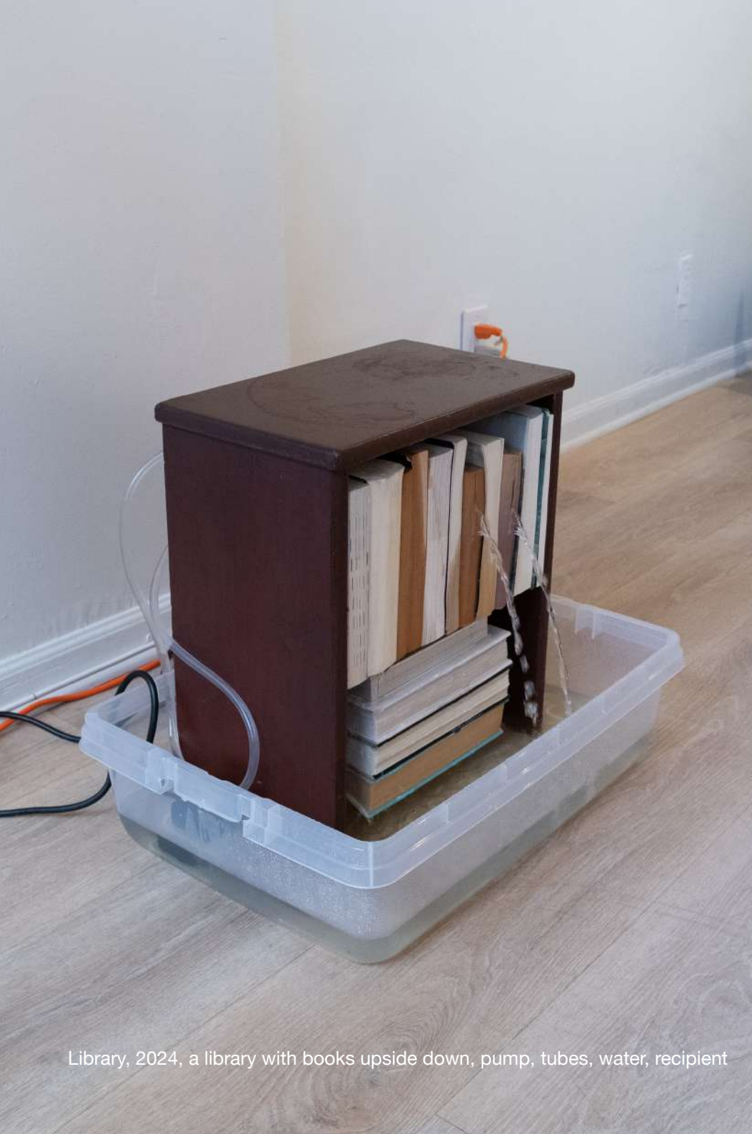
Library, 2024, a library with books upside down, pump, tubes, water, recipient