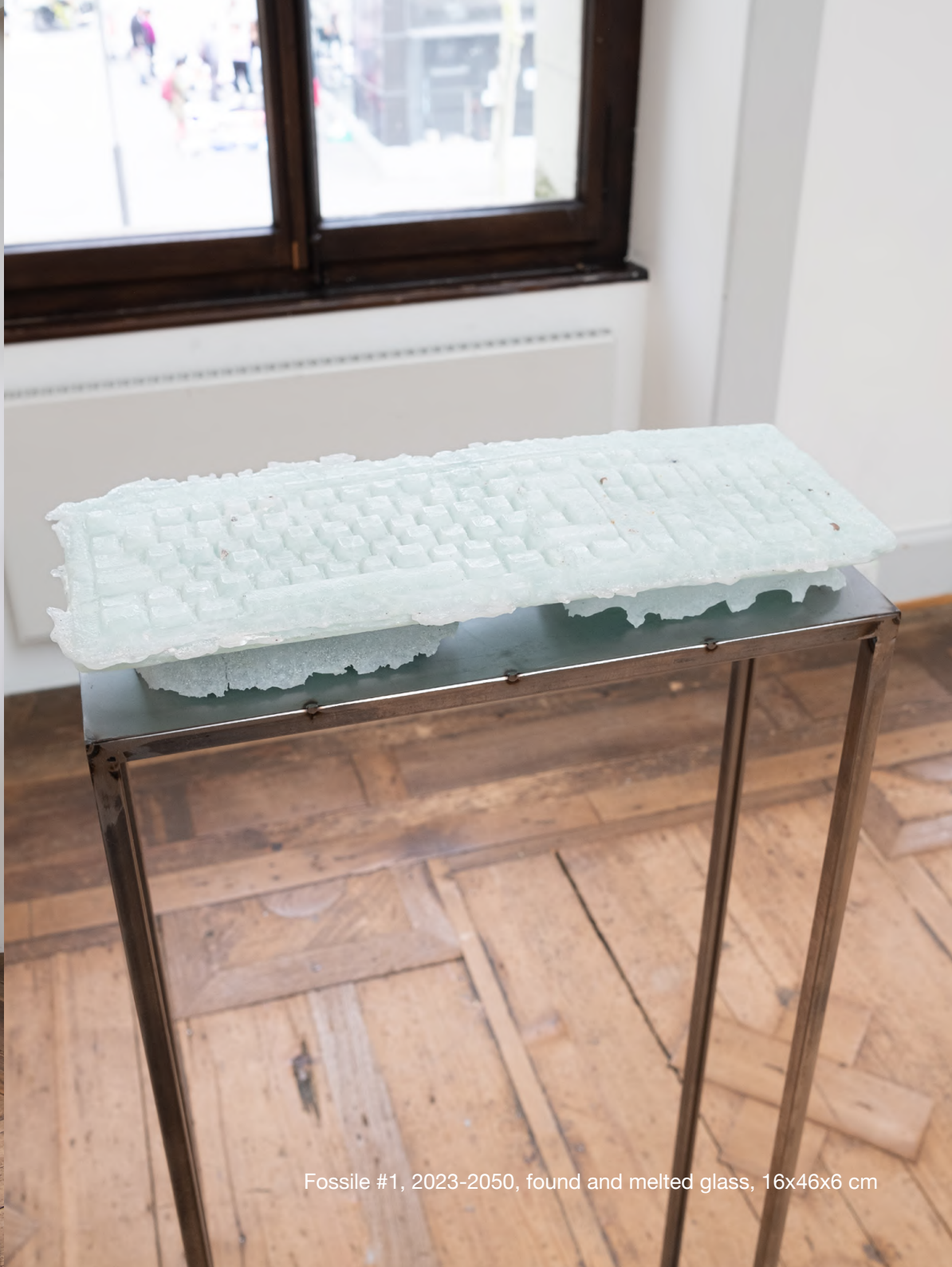
Fossile #1, 2023-2050, found and melted glass, 16x46x6 cm