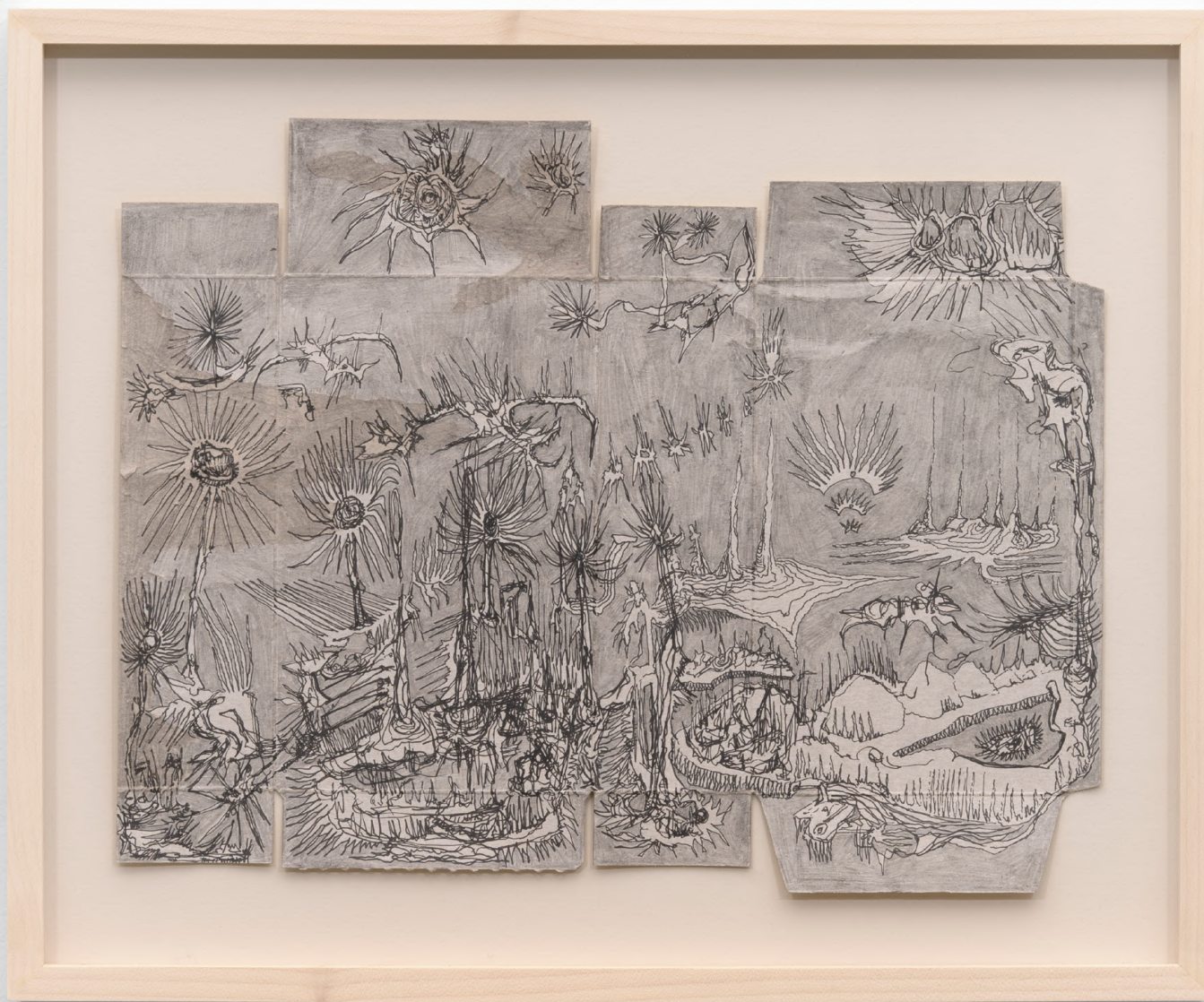
Soft cake about 400 million yrs. ago, 34.5 x 42cm, Graphite on found unfolded cardboard